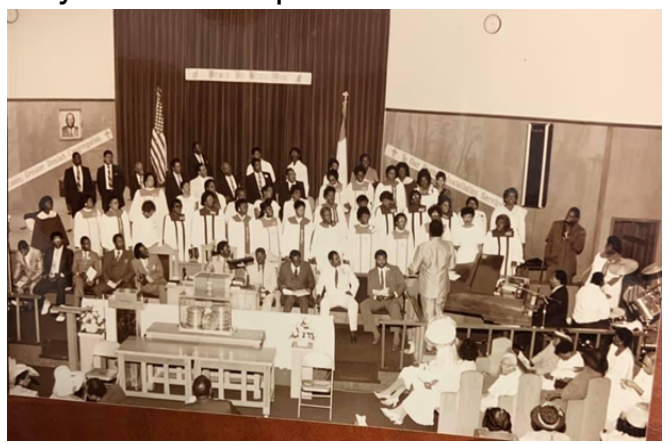
The Early New Mount Zion At Current Site.