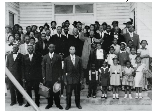
The Early Mount Zion Before Present Site.