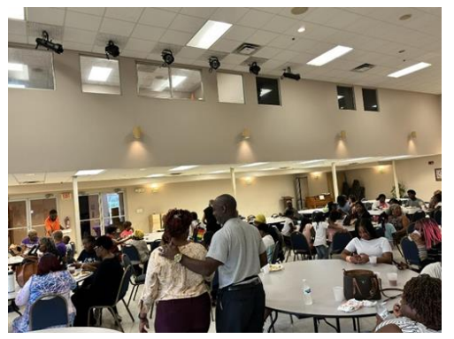
VACATION BIBLE SCHOOL 2023