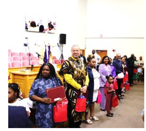
NEW MEMBERS BLESS OUR MEMBERSHIP