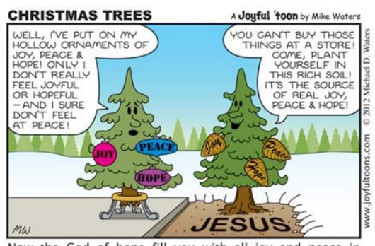
Now the God of hope fill you with all joy and peace in believing, that ye may abound in hope, through the power of the Holy Ghost. - ROMANS 15:13 KIV

If you would like to serve or provide a donation, I can be reached at 813-7897217; <a href="mailto:sheila95@msn.com">sheila95@msn.com</a>.