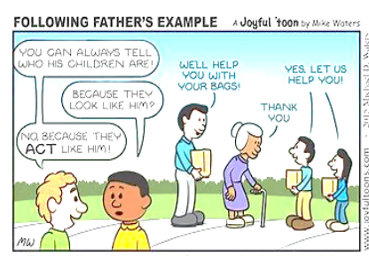
Follow God's example, therefore, as dearly loved children and walk in the way of love, just as Christ loved us and gave himself up for us as a fragrant offering and sacrifice to God.