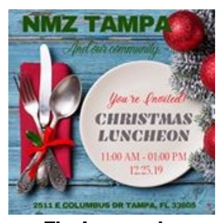
The Inaugural Christmas Day Luncheon (December 25, 2019 (see article under Food Pantry).