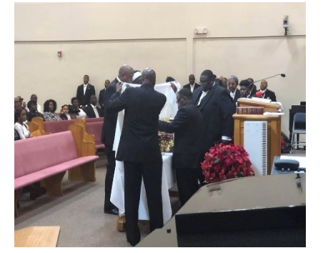
HOLY COMMUNION 6PM JANUARY 6, 2019