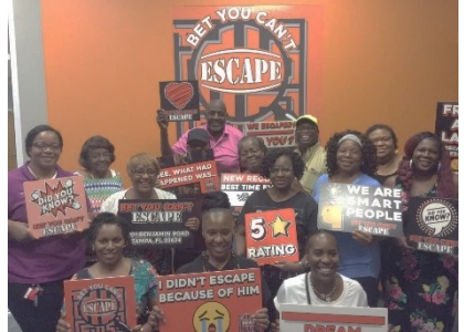
THE ESCAPE ROOM