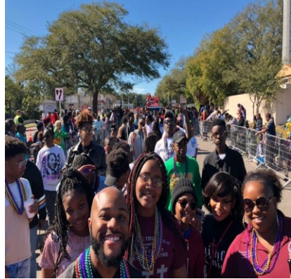
DR. KING'S PARADE JANUARY 21, 2019