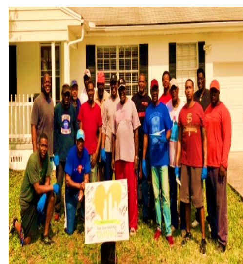
Men at "Paint Your Heart Out Tampa Bay" on April 20.