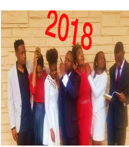
PASTOR'S 5<sup>TH</sup> ANNIVERSARY April 9

6:00AM Easter Sunrise Service on April 1